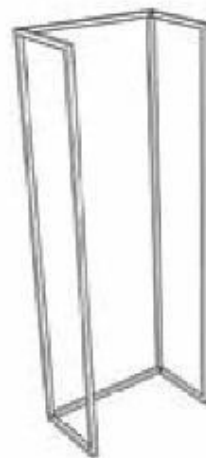
CO-80-M FOLDABLE FREESTANDING PERIMETRICAL DISPLAY