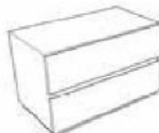
CO-CR-80-M WOOD CABINET WITH 2 DRAWERS