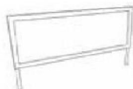
CO-HE-80-M HEADER METAL FRAM WOOD PANEL