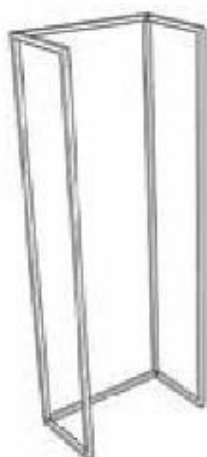
CO-80-M FOLDABLE FREESTANDING PERIMETRICAL DISPLAY