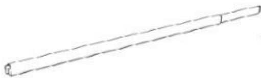
XO-CRT-M TELESCOPIC CROSSBAR