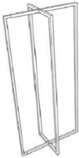
XO-170T-M-B TELESCOPIC RACK METAL