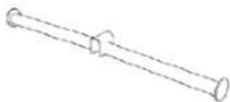
XO-DBF-M DOUBLE FACING 2X200 Ø18 WITH HANGER STOP